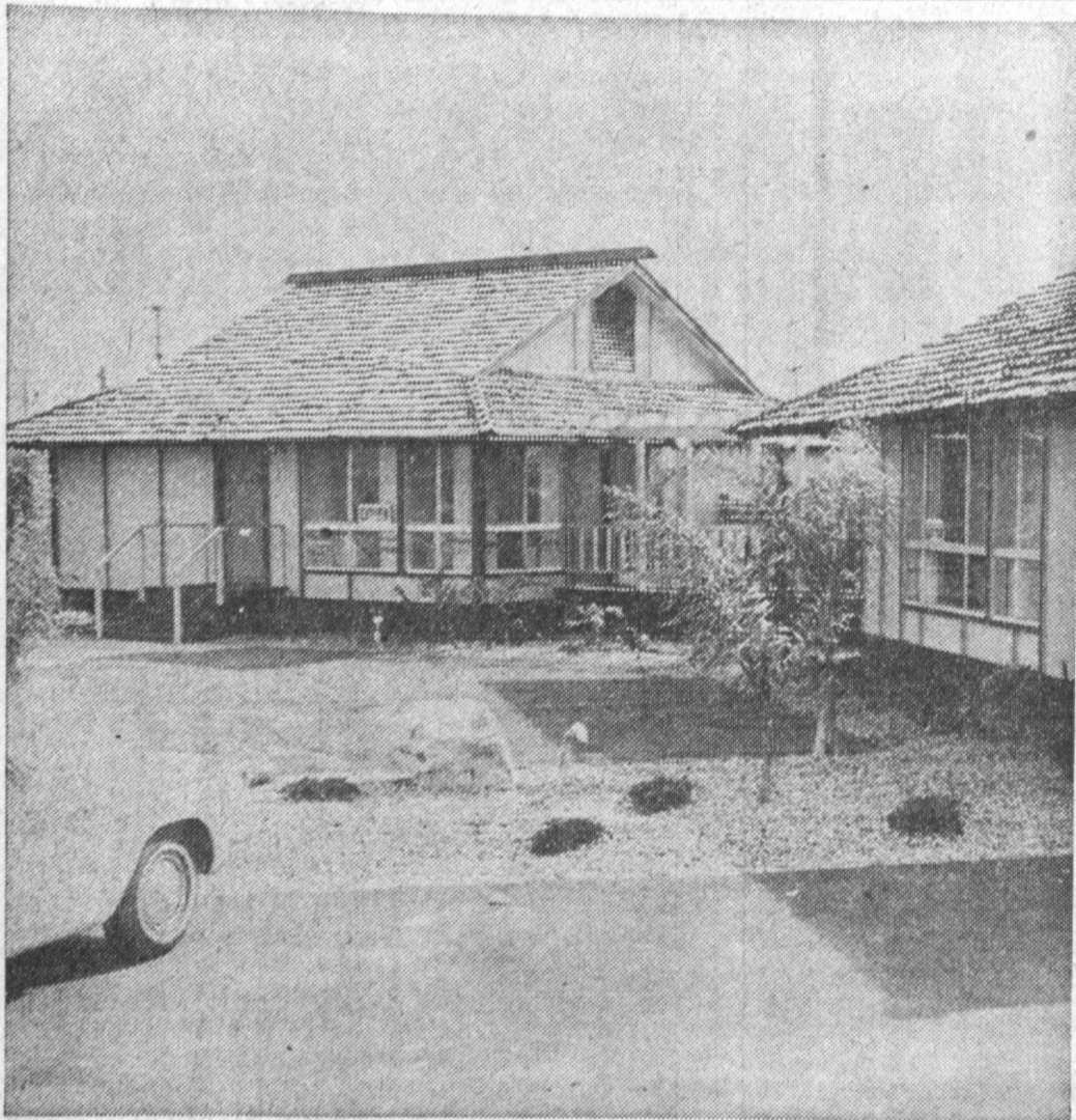
APARTMENT ATTRACTION — The all-electric furnished model apartment (shown above) gives visitors a small sample of what is available at the Del Amo Pacific cooperative own

your own apartments being constructed at 3300 Carson St. The attractive units are a Sovereign Development Company project.