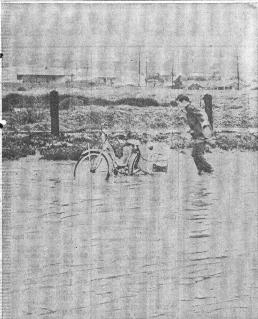
NEITHER RAIN, NOR SLEET! —Torrance paperboy faithfully delivers his newspapers despite rushing waters and the biting wind. Damp but undaunted, Torrance Press delivery boys managed to get Wednesday's paper to each home despite worst storm of the season.