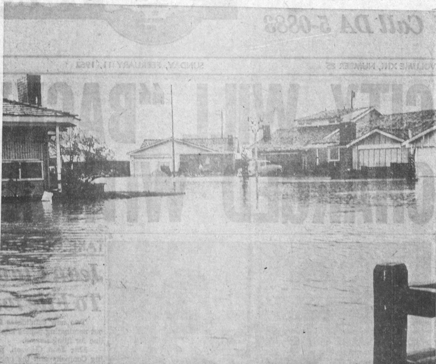
NORTH OF TORRANCE —Flooding of areas north and east of Torrance during the weekend rains cause evacuation of homes threatened with flooding. Some homeowners stayed and vainly attempted to keep the water

tiously along on their way home. Storm, which gathered Thursday, caused millions of dollars damage throughout the county, with Gardena, Redondo Beach and the general Torrance area being the hardest hit.