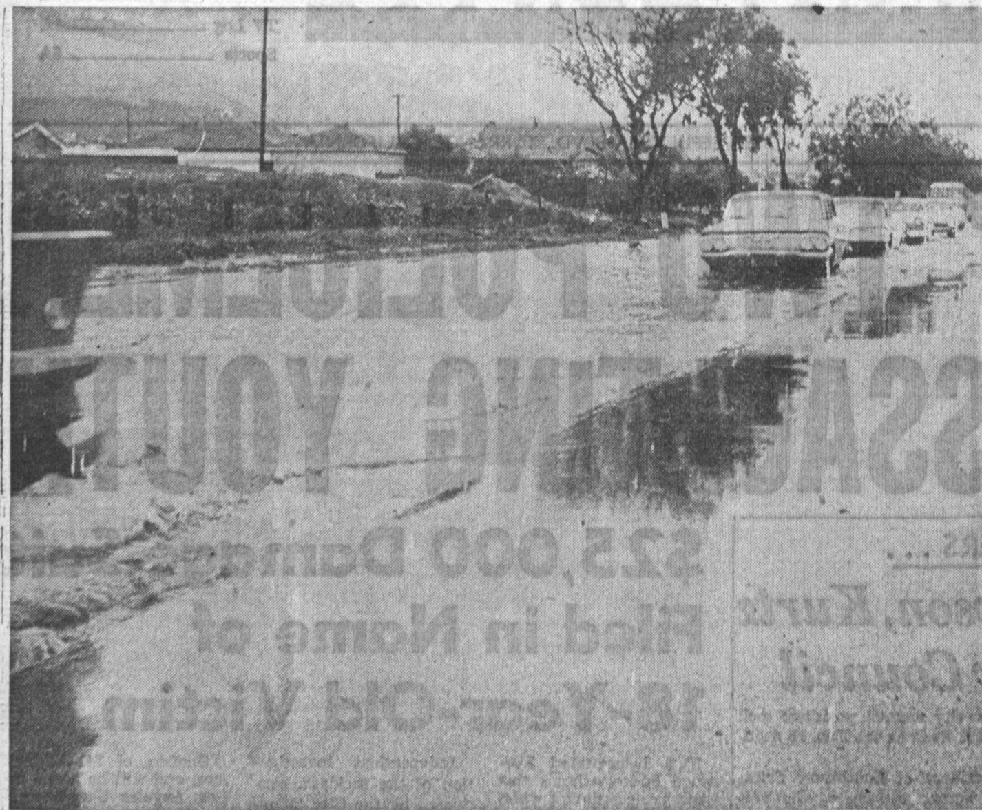
WALTERIA TRAFFIC PROBLEM —Rising flood waters in Walteria caused, for a while, the closing of Pacific Coast Highway. In some areas water rose level with the center divider and drivers were forced to inch cau-

tiously along on their way home. Storm, which gathered Thursday, caused millions of dollars damage throughout the county, with Gardena, Redondo Beach and the general Torrance area being the hardest hit.