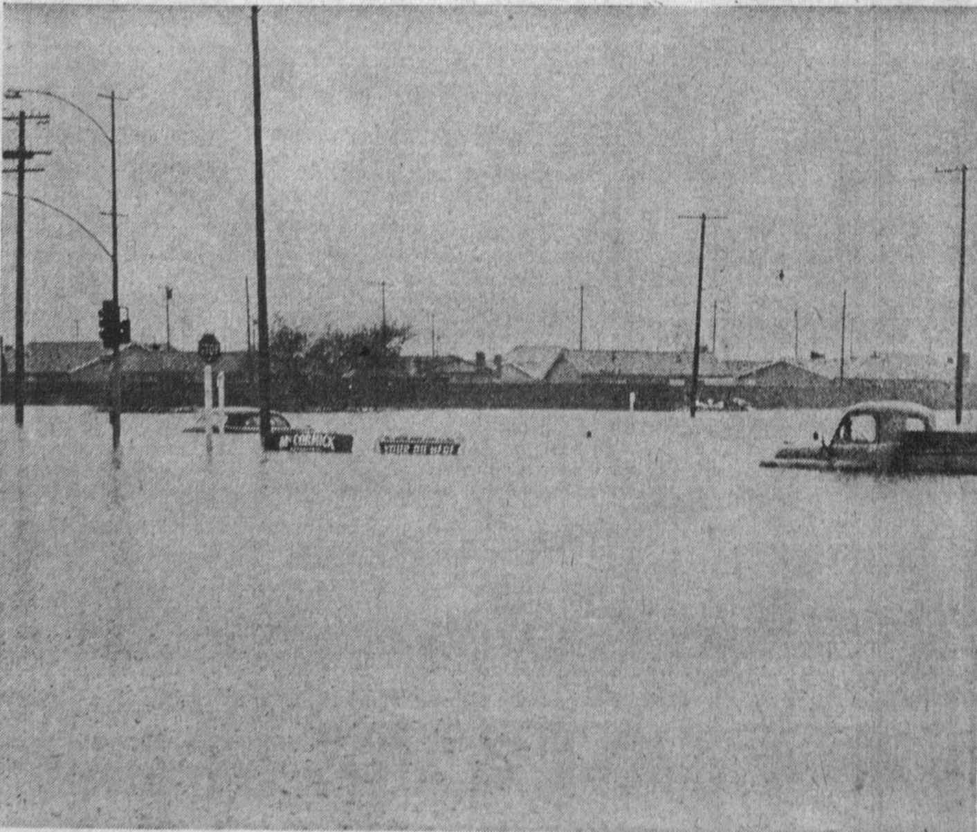
THE RAINS CAME —Flooded intersection of Vermont and Artesia looked more like a lake than one of the main arterials into Torrance as rainwater in some areas rose to a depth of nine feet during the weekend storm.