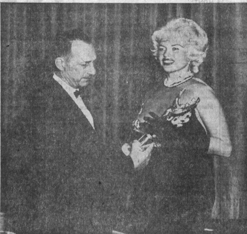
AURORA AWARD Movie Star Jayne Mansfield was presented with the 1962 Aurora Award at the Professional Photographers of Southern California annual banquet held in Pasadena's