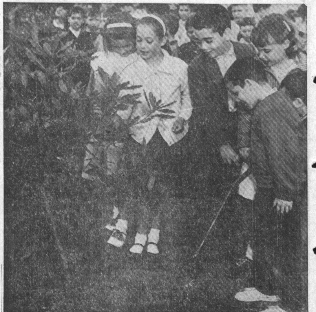
TRANSPLANTING TREE — Children of the religious school of the new Temple Menorah transplant a tree which formerly had been planted in Israel which was watered at the

This tree is one of four planted by the children of the religious schools to beautify the grounds surrounding the new Temple Building at 1101 Camino Real, Redondo Beach.