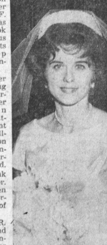
. . . New Bride

Attending both the wedding ceremony and the re- 12401 Archwood, North Hol-