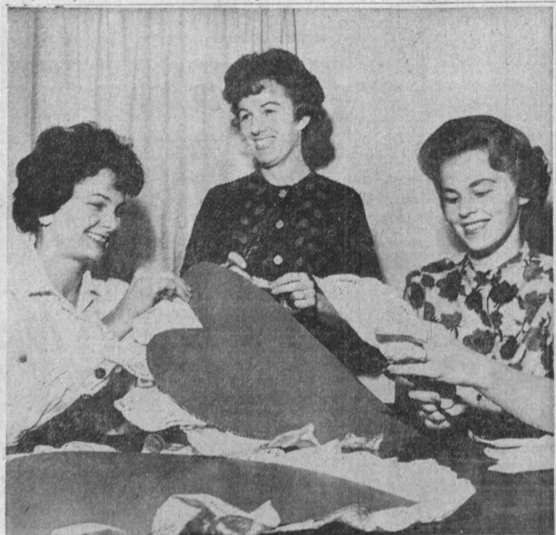
ST. VALENTINE'S DAY —Signs of the approaching Valentine's Day here are shown by members of the Victor Woman's Club in Torrance. Members of the club are planning a dance to