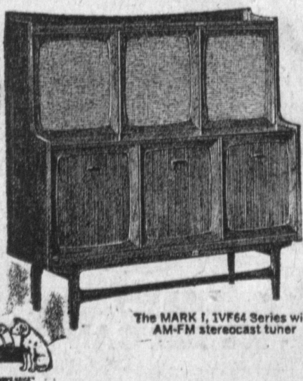
The MARK I, 1VF64 Series with AM-FM stereocast tuner