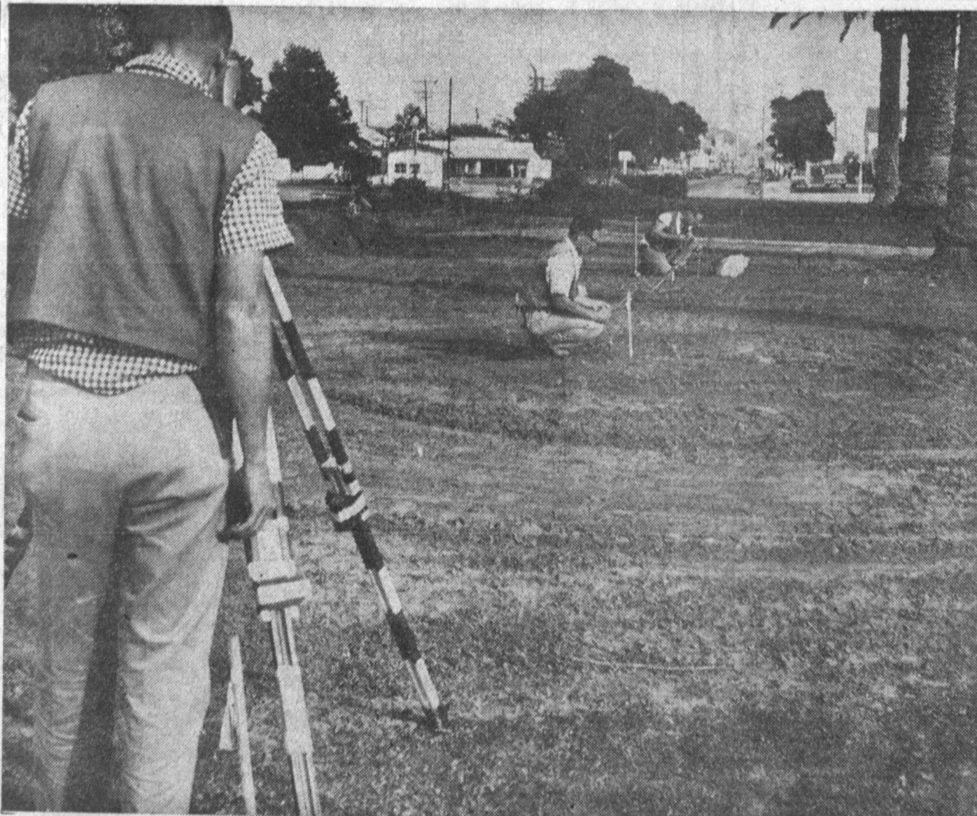
STRAIGHTENING PROJECT—Program to straighten Carson St. in downtown Torrance got underway early this week with the uprooting of trees and shrubs in the park area in front of Torrance High School. Plans, which have been on the books for several years, were held up by litigation which was finally

Visitors will be introduced to staffers and to members of the hospital's board of directors. Outline of the growth of the local facility during its two years of existence will be outlined during the tour.