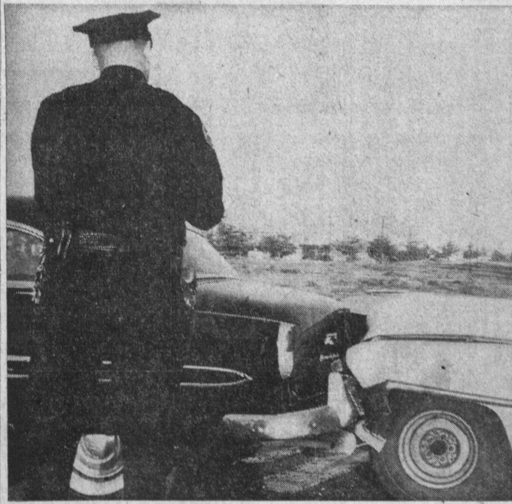
RUSH OF ACCIDENTS—Local police officers are looking forward in despair to the traditional rush of injury and property damage accidents which take place over each New Year holiday. Three day weekend is expected to be filled with accidents