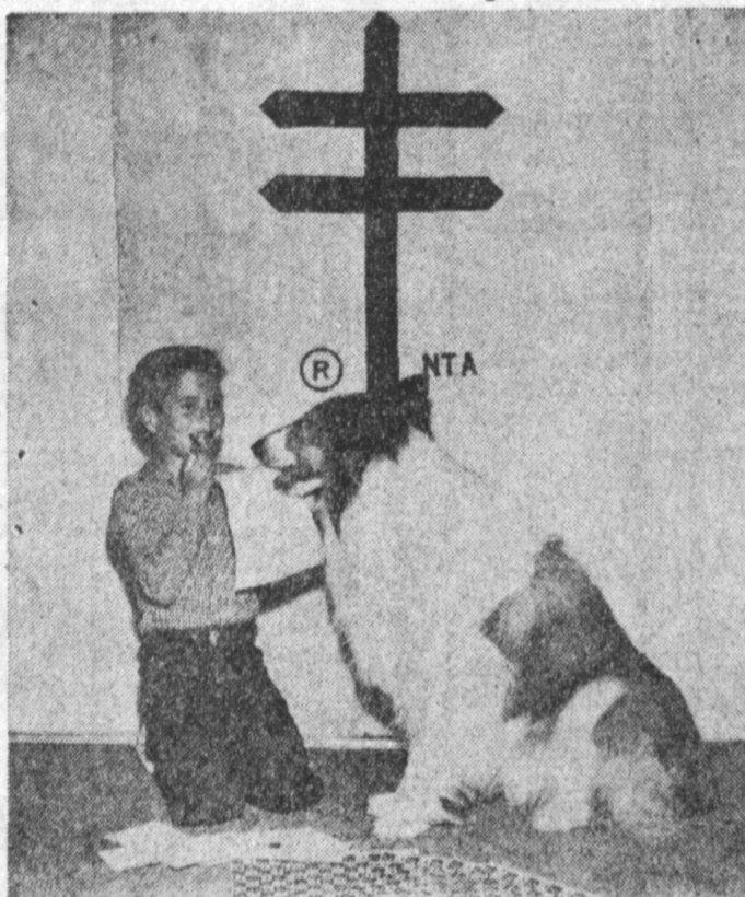
CONTRIBUTION—Lassie and Pal Jon Provost (Timmy of the "Lassie" TV show) are both busy licking Christmas Seals to put on their cards and packages. Christmas Seal contributions help in the fight to wipe out tuberculosis.