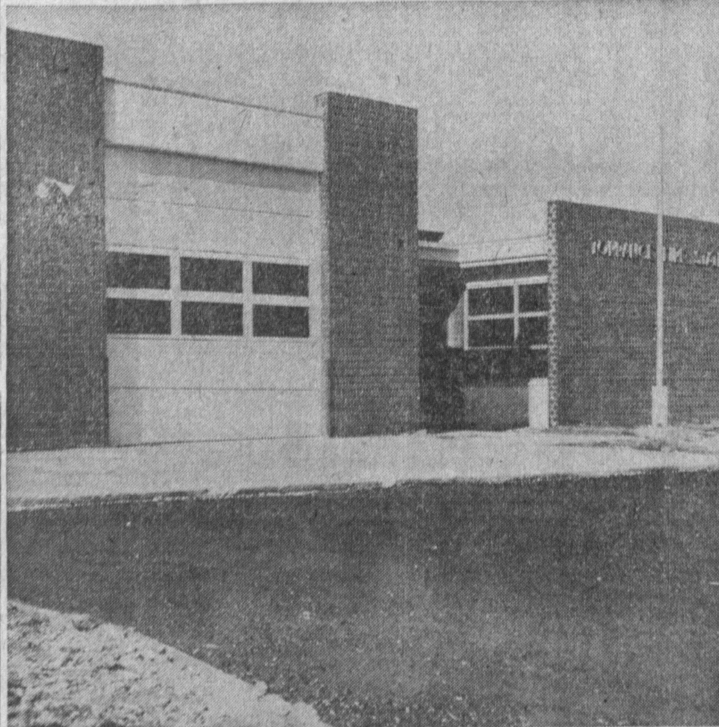
ALMOST READY —$70,000 fire station at Torrance Municipal Airport is nearly ready for its official opening, it was reported yesterday by fire department officials. Still to be installed are utilities and last minute

"It also is good business on the part of customers to report to store representatives any instance of stealing from counters, shelves or clothing racks that customers may detect."