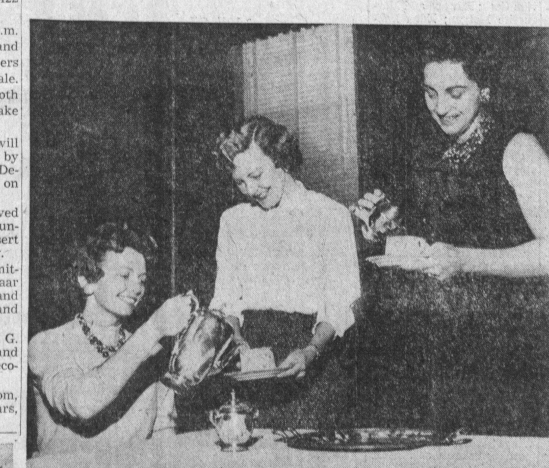
Voters' League 1eets to Form Two-Year Plans

Studies for 1961-64 will be planned next week by members of the Palos Verdes League of Women Voters.