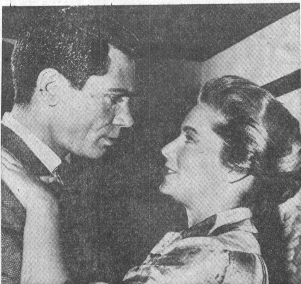
CHECKMATE — Vera Miles is guest star in "The Crimson Pool," portraying an old friend of Jeff Corey who is involved in an

"Wave Goodbye to Grandpa," Tuesday at 8:30 p.m. on ABC-TV, Channel 7.