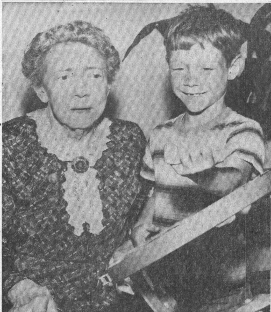
THE NEW BREED — A magician's prop is found by Billy Mumy and Elizabeth Patterson which leads police to a slayer in

Troy Donahue, star of the "Surfside 6" TV series, will be the Prince Charming of the "Cinderella" float.