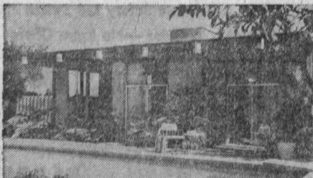
Exterior view of Encino Hills Model Home shows how effectively the architecture joins outdoors with indoors.

Marian Lee, builder of Encino Hills says, "BALANCED POWER is the common-sense approach to modern living in Southern California. It puts two powers to work—each one doing the jobs it does best. Electricity is provided for lighting, TV, and small appliances. Gas handles such important household jobs as cooking and year 'round air conditioning."