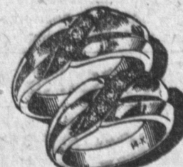
Bands of Love Sculptured, matched wedding bands reg. $110 $69.50 $1.50 weekly