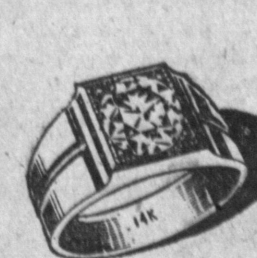
Man's Ring Impressively handsome reg. $139 $99 $3.00 weekly