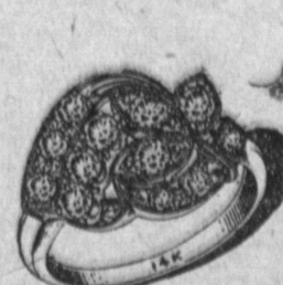
Fabulous Princess Ring Strikingly styled reg. $139 $99.50 $2.00 weekly