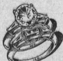
Superbly Elegant A real treasure! reg. $825 $695 terms