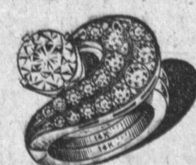
Perfect "300" Sensational 17 diamond set both for $300 $5.00 weekly