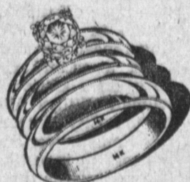
Terrific Threesome So simply smart reg. $150 $99.50 $2.00 weekly