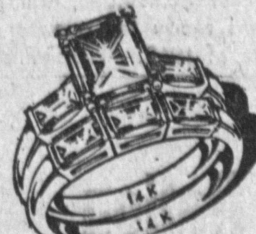
Exquisite Emerald Cut Sophisticated set reg. $375 $275 $5.00 weekly