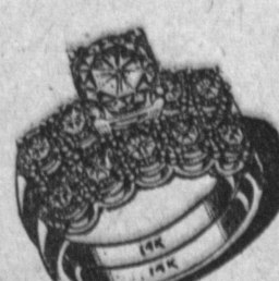
So Lovely, So Lasting 10 magnificent diamonds reg. $225 $149 $3.00 weekly