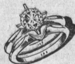
Flaming Star Magnificent new creation reg. $200 $129 $3.00 weekly