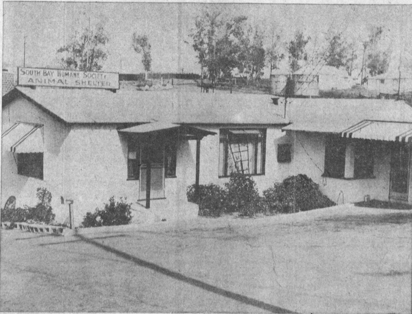
UNDER FIRE—Petitions, bearing 606 signatures, will be presented to the Torrance city council Tuesday night requesting that the city seek another pound service than the presently contracted South Bay Humane Society. Signers of petitions cited lack of service and unkempt appearance of the local shelter as the reason for their dissatisfaction. New contract was signed recently by the city with the organization over protests by some councilmen.