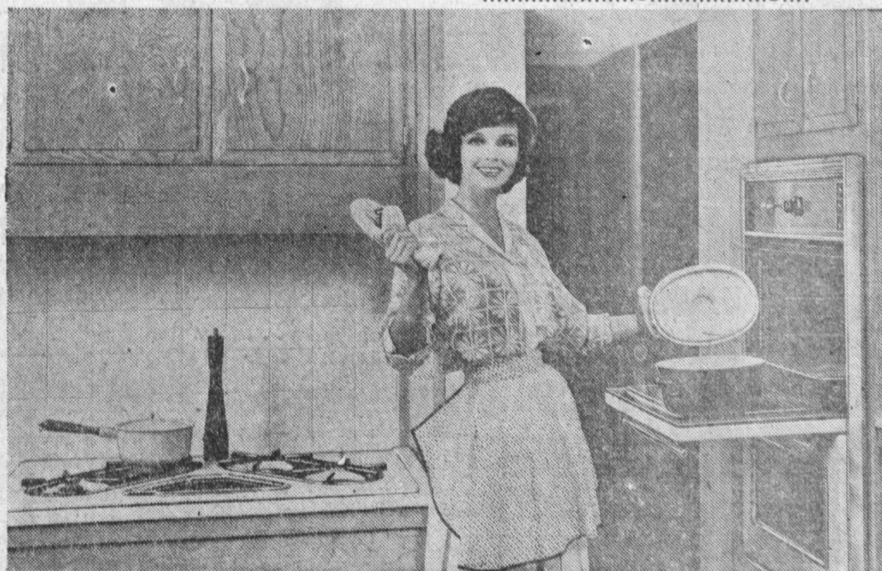
© 1961 S. CAL. G. C. & S. CO. G. C.

(of course... it features a modern gas range!)