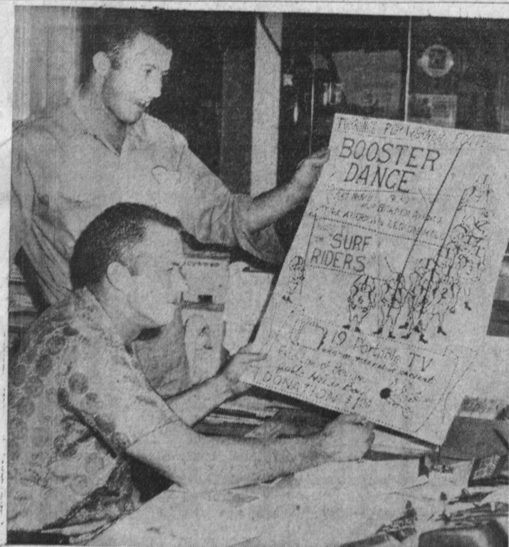
WARNER LEAGUE FUNDS — Parents of youngsters participating in Pop Warner Football League activities have scheduled a fund raising dance for Saturday night at the American Legion Hall in Torrance. Shown with one of the posters on display