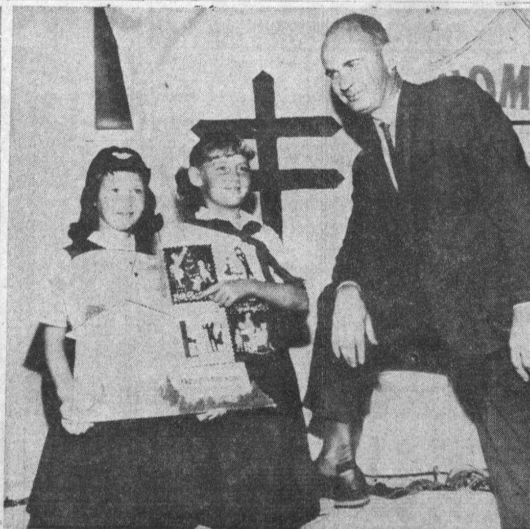
YULE SEAL KICKOFF — Traditional opening of the Torrance Christmas Seal campaign took place Monday morning at the local office of the telephone company. Shown with posters, which will be placed in the shop windows of cooperating Torrance

First meeting of the year was held in order to elect officers for the fall semester and to acquaint new members with club activities.