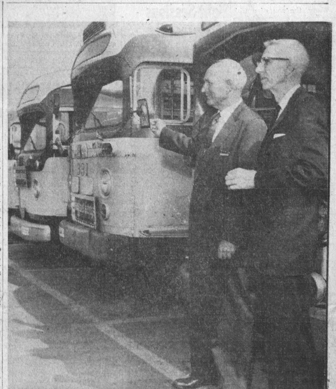
NATIONAL WRITE-UP —Torrance Municipal Bus Lines will be the subject of a write-up in a popular magazine of national circulation, it was learned this week. Article, which will appear in Westways Magazine in the near future, will tell of the city's efforts

School, which will be built at the corner of Spencer and Victor Sts., will cost approximately $4,500,000.