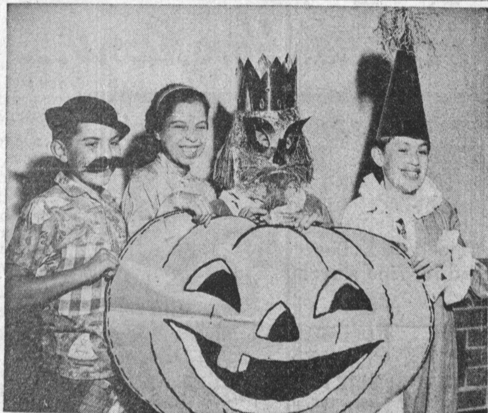
SEASON FOR MADNESS—Torrance youngsters will don outlandish garb on the evening of October 31 and prowl through the city's darkened streets in search of candy tributes or mischief. Most of the city's residents will pay up to the extorting threats of "trick or treat" but the holdout few will be sure to get their screens and windows soaped.

idents will pay up to the extorting threats of "trick or treat" but the holdout few will be sure to get their screens and windows soaped.