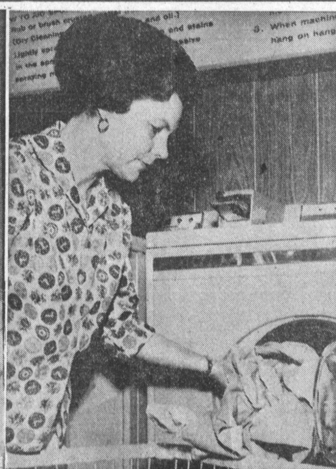
IT'S THE EASIEST way to clean clothes. Just put them in the machine, close the door, and put $2 in the coin slots. Put in two quarters at a time. Then just relax 45 minutes and your clothes will come out fresh, clean and practically wrinkle-free.