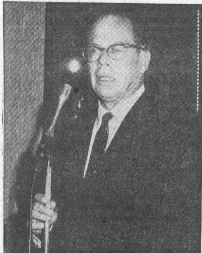
SENATOR SPEAKS —Senator Thomas A. Kuchel, guest speaker at Monday night's meeting of the South Bay Young Republicans, here reports briefly on substantial gains made by the Republican party in California during the past year. Meeting was held at the Fish Shanty in Waveria.