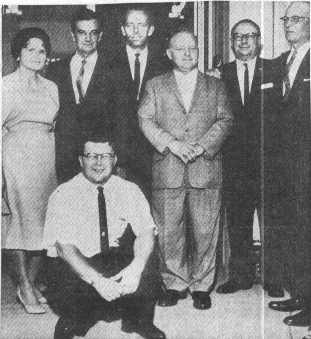
BUILDING COMMITTEE of Torrance-Lomita Board of Realtors meet to discuss final plans for construction of new 6000 square foot auditorium to be added to present Board office building, 22833 S. Arlington.