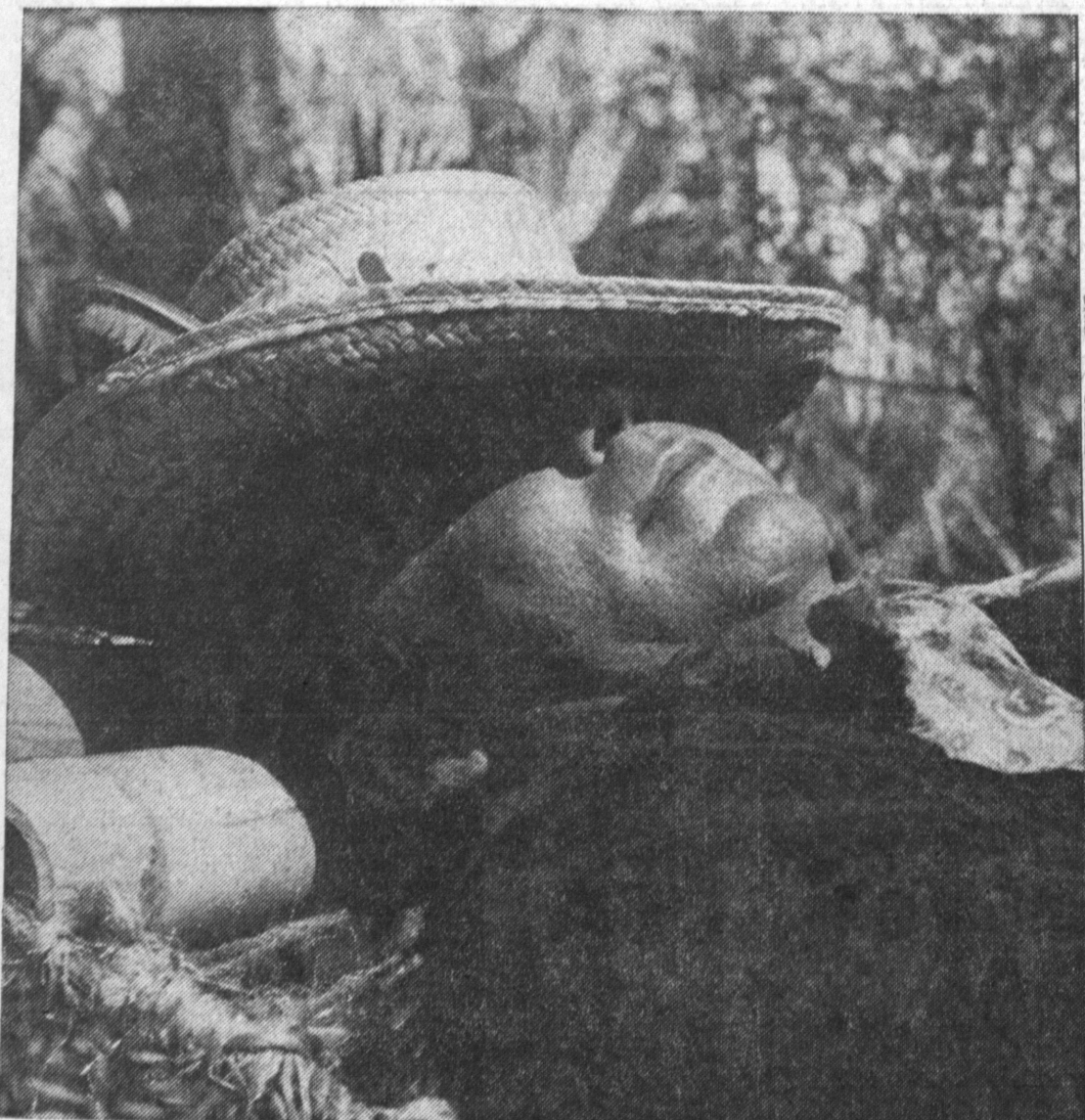
CAMERON MITCHELL stars as "The Beachcomber," which appears Saturdays at 8 p.m. over KTTV, Channel 11. Show has South Seas setting and premiered this past week.