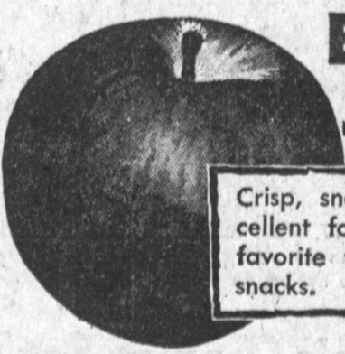
Extra Fancy Jonathans

Crisp, snappy red apples, ex- cellent for all purposes. It's a favorite for lunches and for snacks.