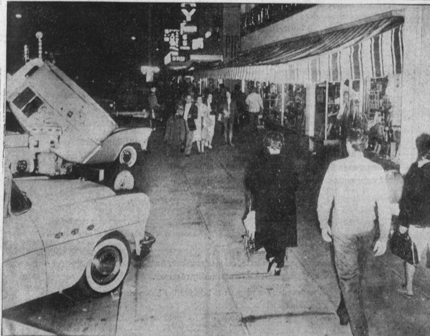
CROWDED STREETS — Crowds of Torrance shoppers took advantage of the exciting specials offered by downtown merchants during the outstanding Moonlight Sale Thursday night. Held between 7 and 11 p.m., each of the participating shops