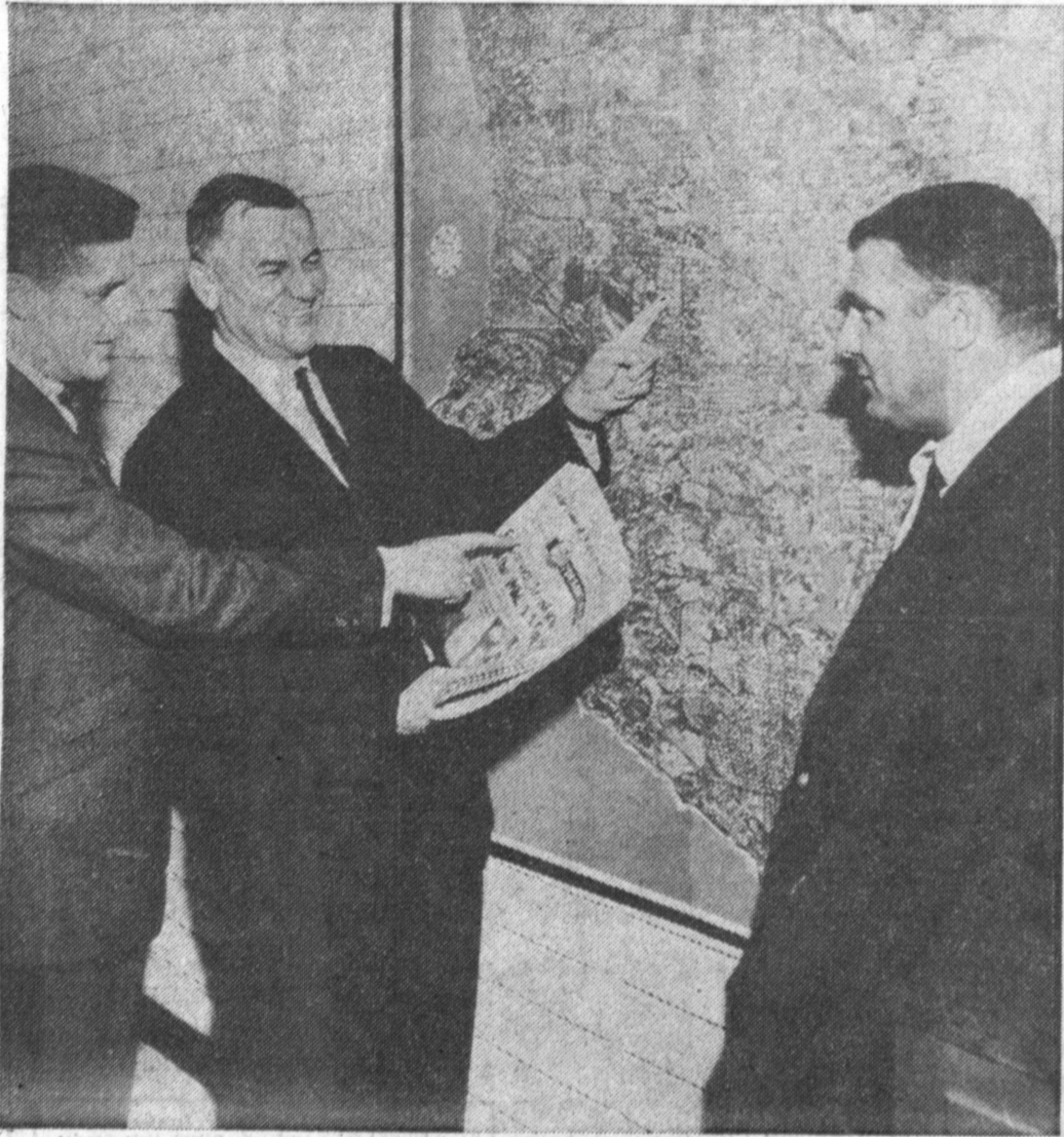
DISTINGUISHED VISITOR — Congressman Alphonso Bell, of the 28th District, toured Torrance Thursday as a guest of city councilmen. Following a luncheon at the Palms Restaurant, hosted by the city, Bell visited