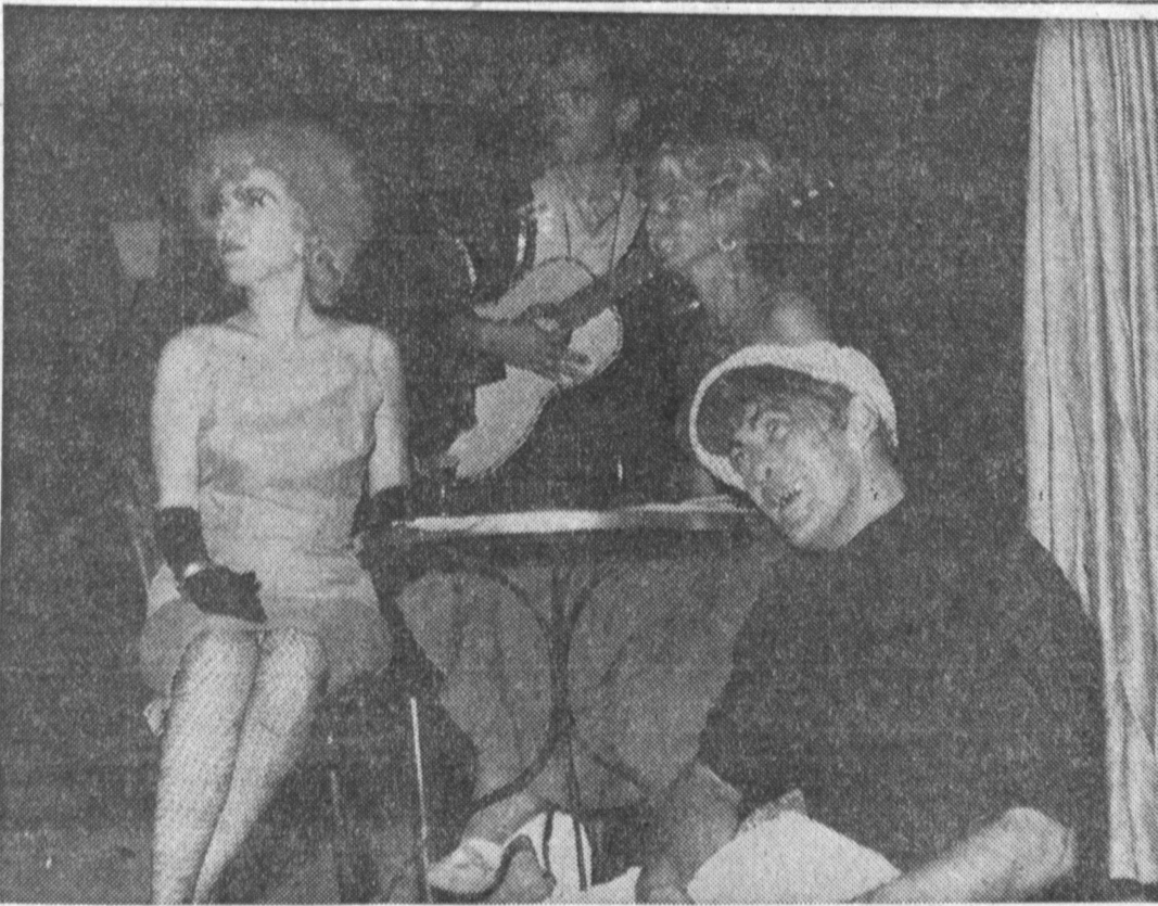
HELD OVER FOR an additional weekend is Chapel Theatre's production of the "Madwoman of Chaillot," which is the current attraction of the theatre, located behind the

Use Press classified ads to buy, rent or sell. Phone DA 5-1515.