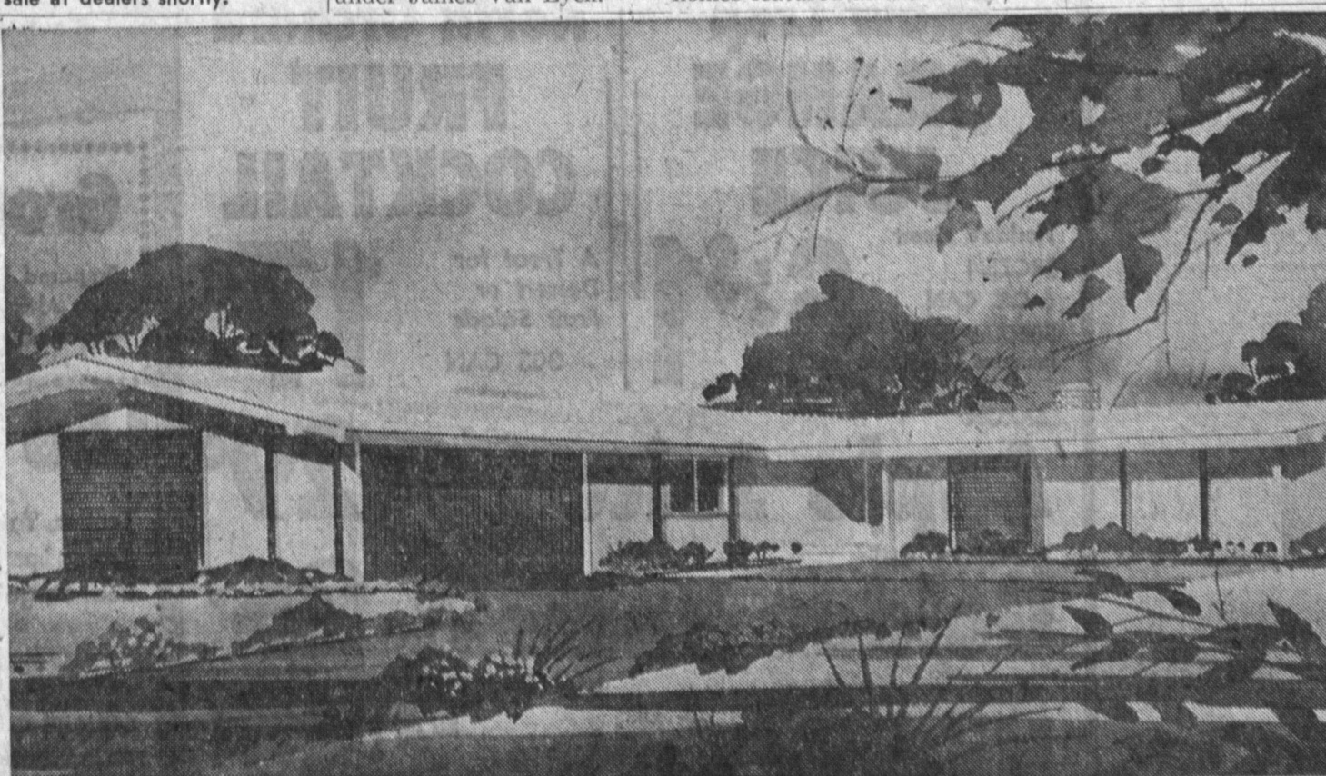
ON PENINSULA: Shown is one of many attractive stylings at Grandview Palos Verdes, where some models are now available for occupancy. Over 1,500 families have purchased homes by Grandview on the picturesque peninsula.

Use Press classified ads to buy, rent or sell. Phone DA 5-1515.