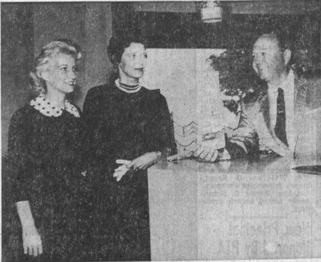
WOMEN PILOTS will attend a three-day conference of the Long Beach Ninety-Nines Sept. 22-24. The women will stay at the Jump 'n Jack Hotel. Featured guest speaker