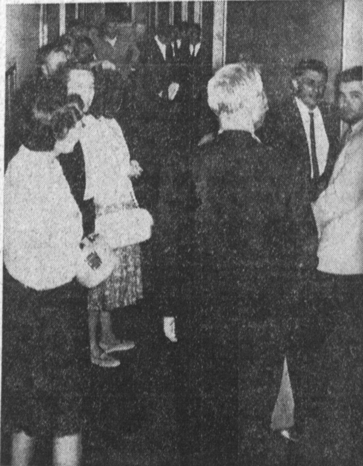
CUT BUS SERVICE —Nearly 100 parents of Torrance students showed up at board meeting Monday night to protest against curtailment of school bus services and to hear report submitted by special committee established by the board to study the problem. Service for some younger children will be continued temporarily and buses for handicapped children will run on schedule as before.