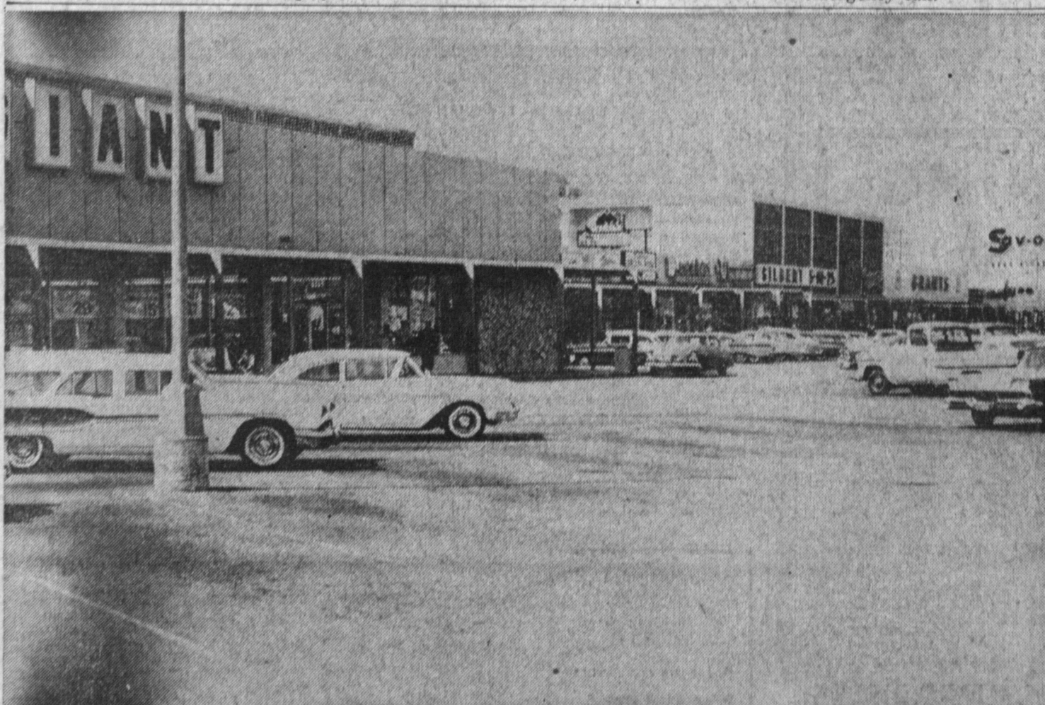
WELCOME NEW FIRM —Businesses in the North Torrance Shopping Center, 190th and Anza, will welcome a new neighbor to the center tomorrow when W. T. Grant's store opens its doors. Highlights of the opening day celebration will include a ribbon cutting by prominent civic and Chamber of

Commerce officers, gifts for children and adults and an opening day galaxy of bargains in each of the shops in the center. For further information on this event, see section "B" in this issue of the Torrance Press.