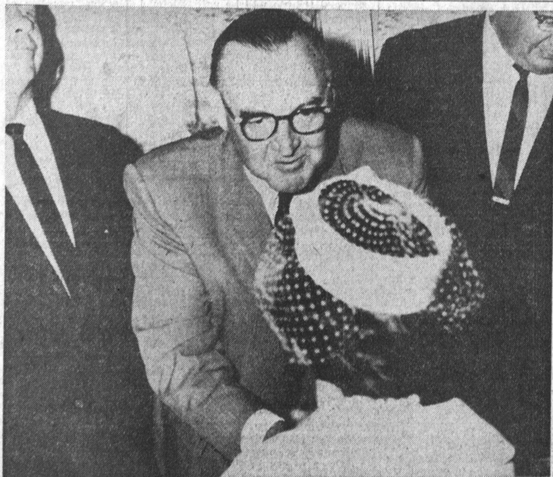
GREET THE GOVERNOR —Hundreds of Torrance area residents turned out Monday to greet Governor Edmund G. Brown at a luncheon and reception held at the Plush Horse Restaurant. Heading the deputation of Tor-