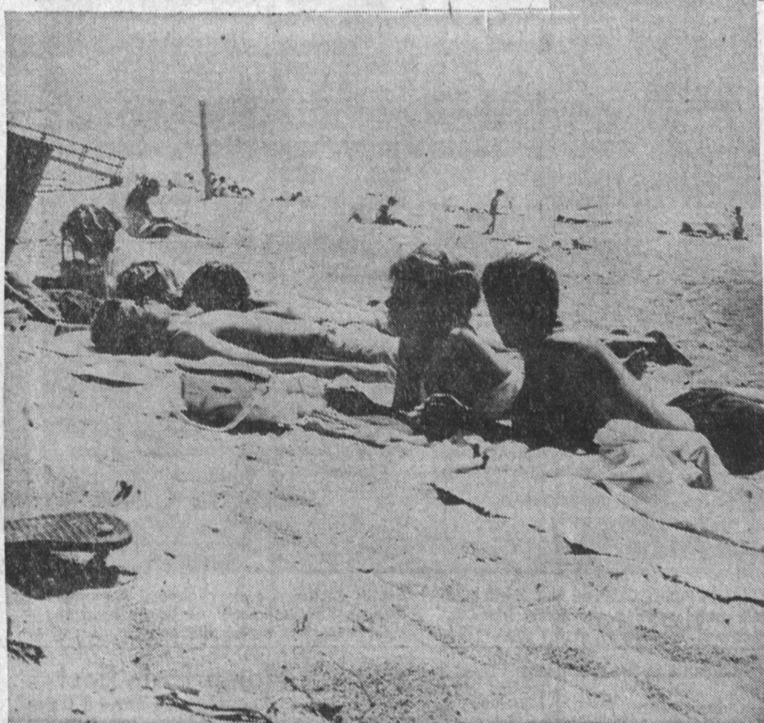
SUMMER'S LAST SWIM before returning to classes Monday is taken by these youngsters. The summer has been lazy, lounging and lovely, but all good things must come

The Los Angeles County enrollment accounts for more students than total enrollment in individual states including California, Illinois, Michigan, New York, Ohio, Pennsylvania and Texas.