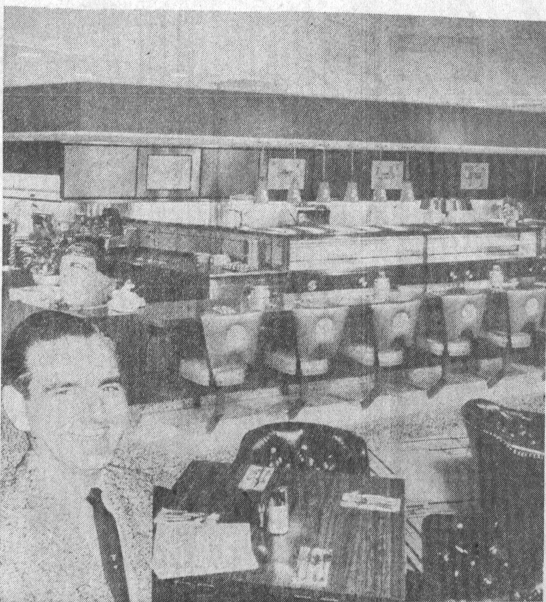
THE PLUSH PONY COFFEE SHOP will hold its gala grand opening ceremonies Monday, Tuesday and Wednesday at the shop, 1716