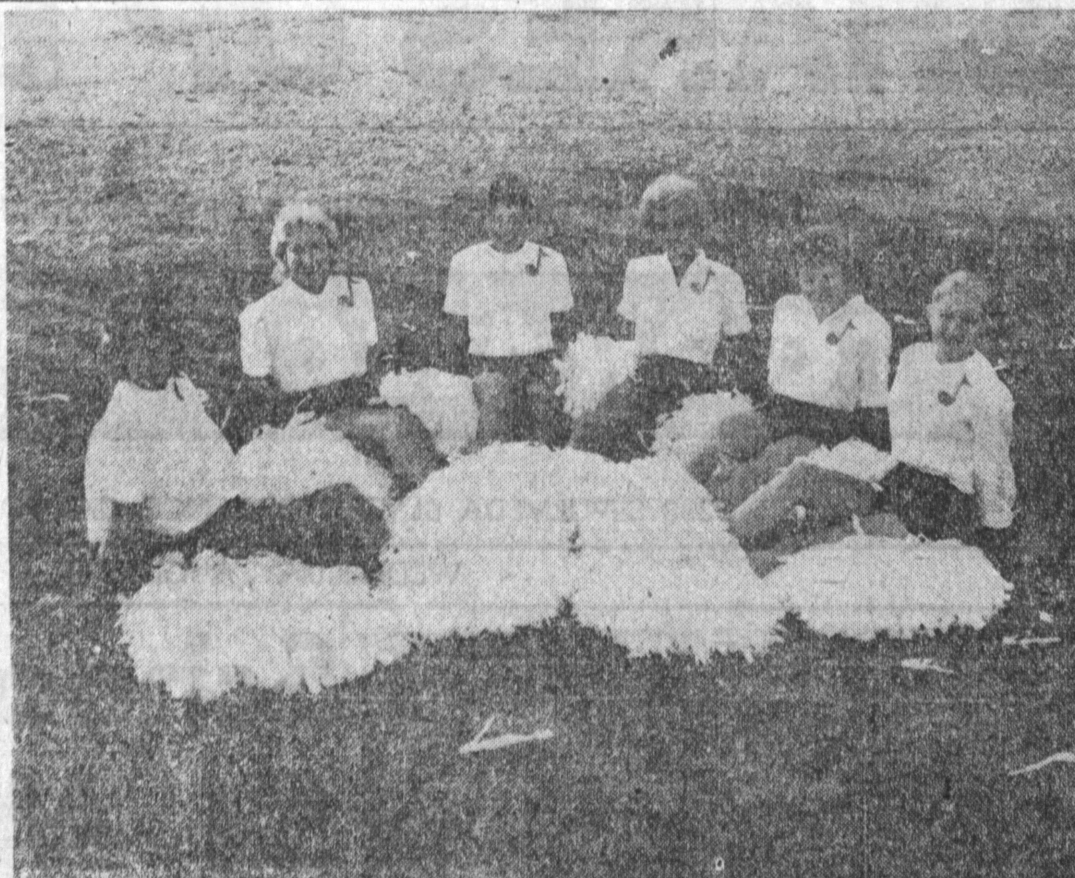
READY FOR FALL are El Camino College coeds who will serve as song queens for the coming semester. Practicing routines which they will put into action at the annual alumni