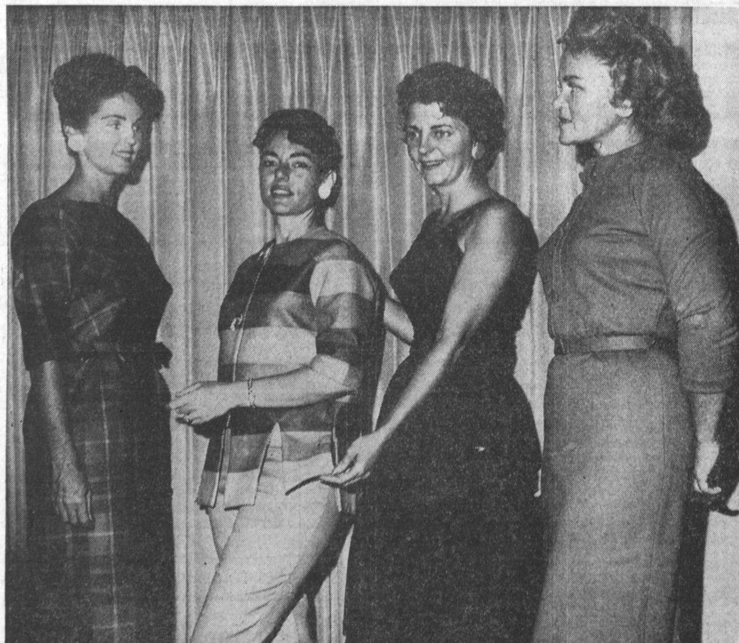
AUTUMN is rapidly approaching and with this thought in mind members of the Victor Woman's Club are rehearsing for their fall fashion show, Thursday, Sept. 14. The show will

include styles for women and girls. In addition a demonstration on make up and hair styles will be included. The show will be at the Redondo Beach Elk's Club.