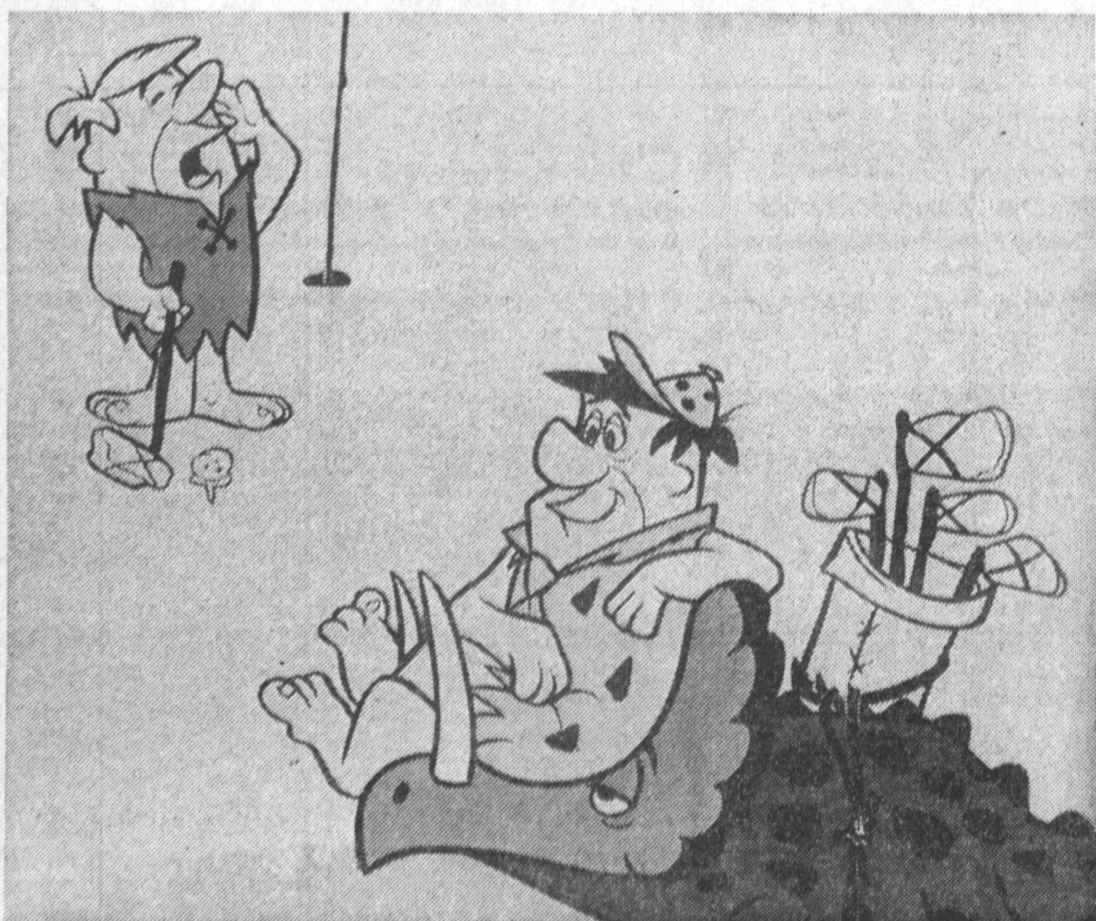
FUN —The Flintstones—Fred Flintstone and Barney Rubble enjoy golf, caveman style, during an episode of the animated series

seen Friday at 8:30 p.m. on ABC-TV, Channel 7.