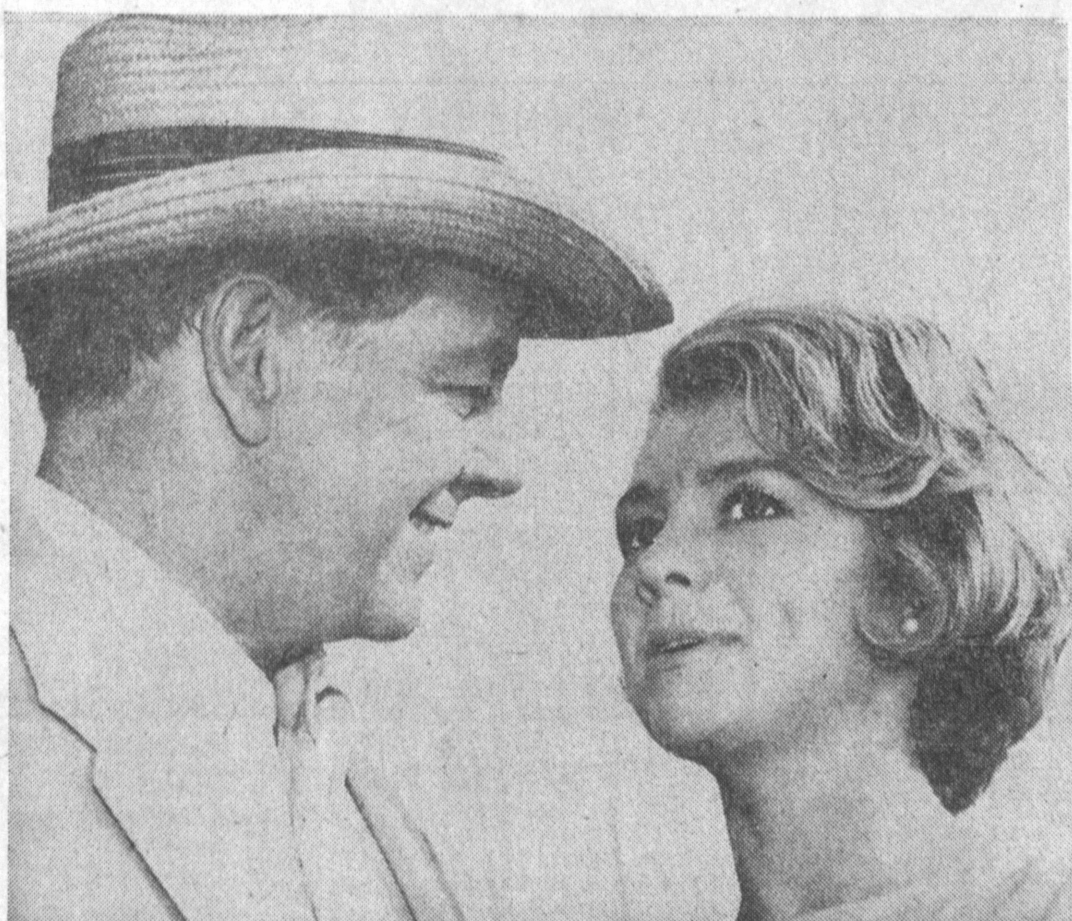
DEATH —Swedish doctors portrayed by Paul Langton and Inger Stevens have trouble with a witch doctor in "Angel of Death," this

seen Friday at 8:30 p.m. on ABC-TV, Channel 7.