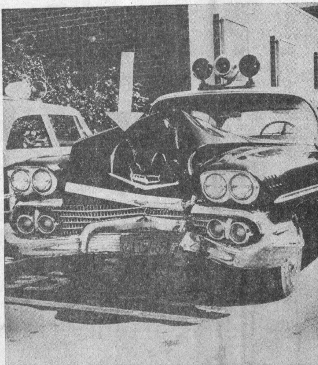
LOOK WHAT A POLE DID—A patrol car of the Sheriff's Department struck a telephone pole Thursday morning during pursuit of a speeding auto on Hawthorne Blvd.

When the auto suddenly stopped, the patrol car was forced to swerve to the left and found itself facing a telephone pole.