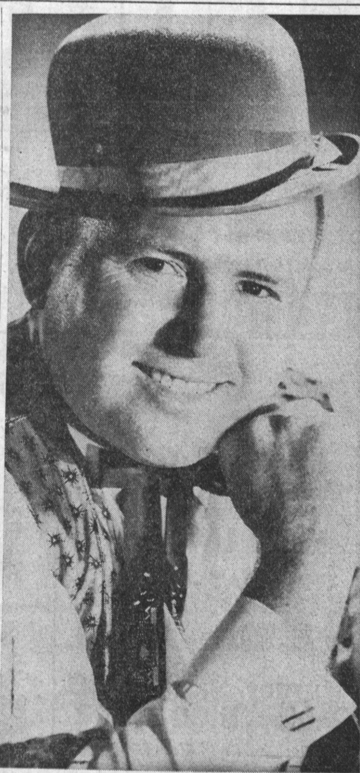
"BIG" TINY LITTLE Returns to Marineland