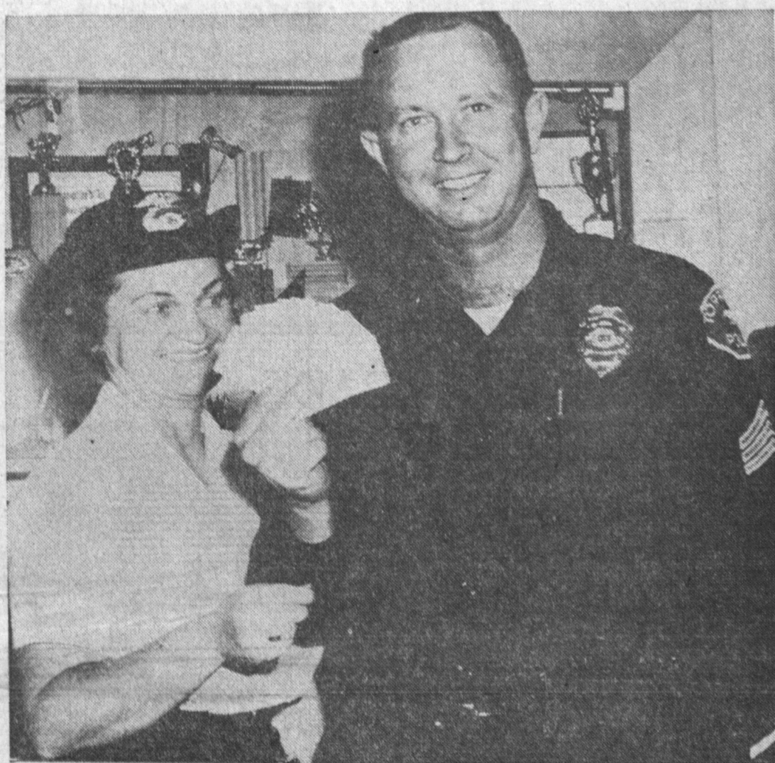
POLICE SHOW TICKET —First batch of tickets, of the non-speeding kind, were received this week by the Torrance Police Department. Tickets are for the annual Torrance Police Show and Dance, October 28 at the Long Beach Municipal Auditorium. Local Police Department will take over the huge