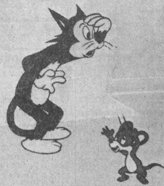
LITTLE ROQUEFORT, the mouse, puts the hex sign on Percy, the cat, in episode from "The Heckle and Jeckle Cartoon Show" which screens every Wednesday at 7 p.m. on KTTV, Channel 11.