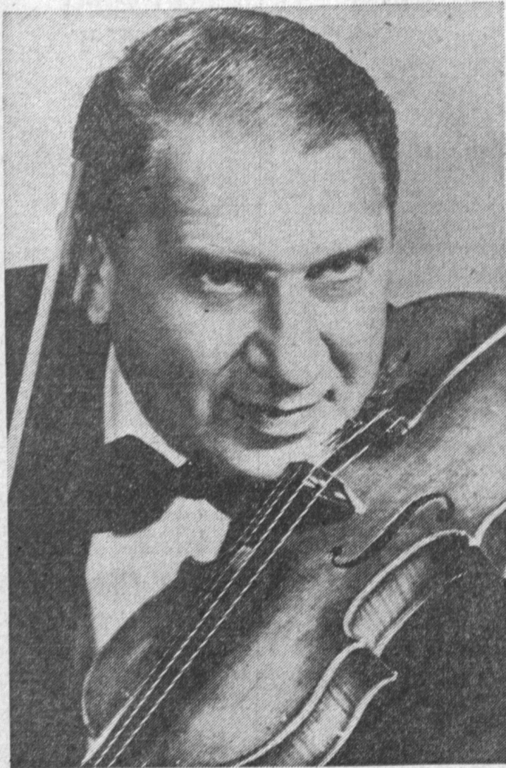
COMEDIAN Henny Youngman, whose trademark is his violin, will star in "The Golden Thirty," on the U.S. Steel Hour, Wednesday, August 9, at 10 p.m., via Channel 2. About a performer who has lost his popularity with the public, this "live" teleplay will also star Keir Dullea and Nancy Kovack.