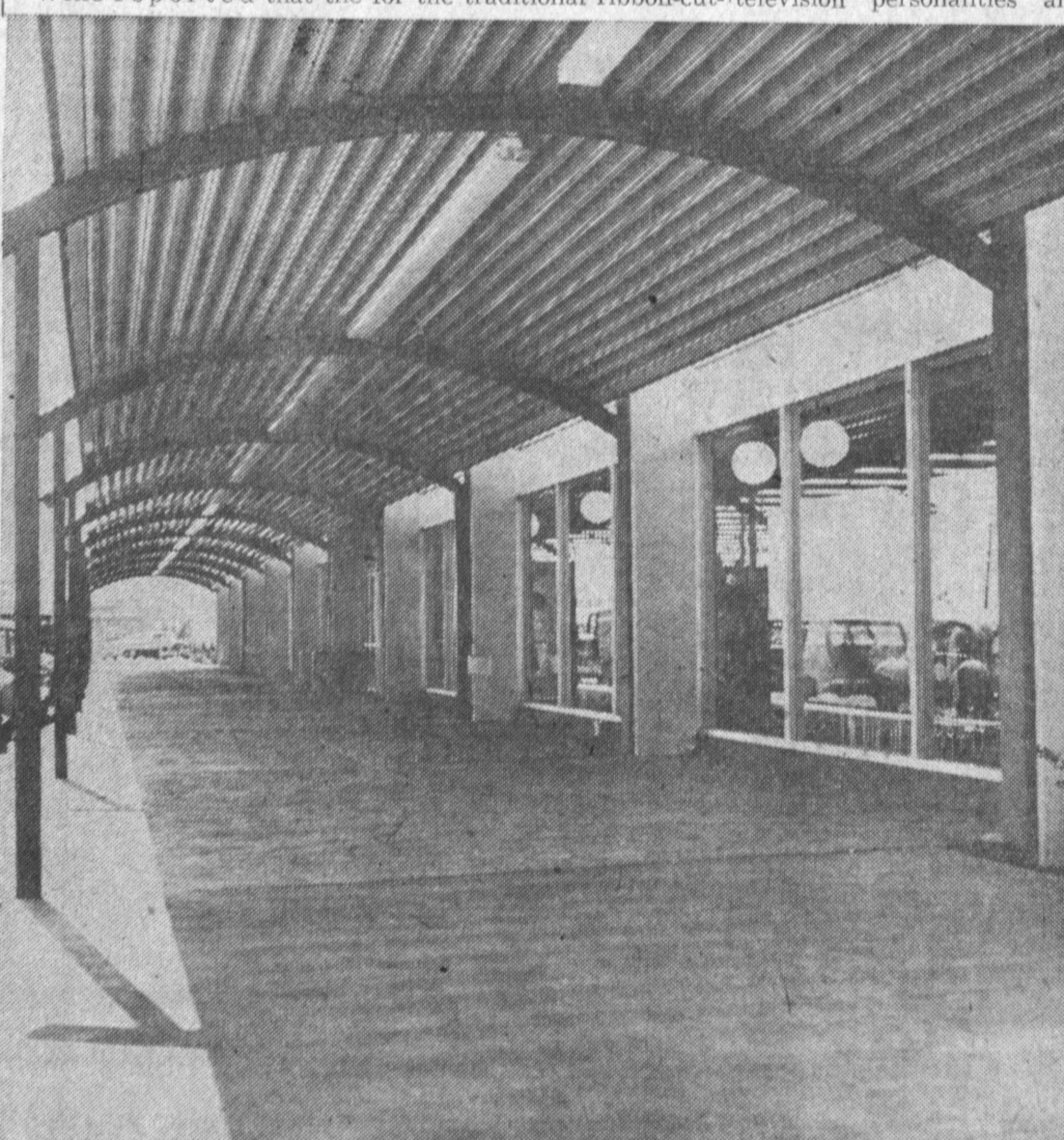
SPACIOUS MALLWAY of the new Zodys discount department store is only one of the contemporary features of the structure which is about to open Thursday, August 10. Gifts

taries, and motion picture and television personalities will participate in the event. It is located at the Los Coyotes diagonal at Woodruff and Spring.