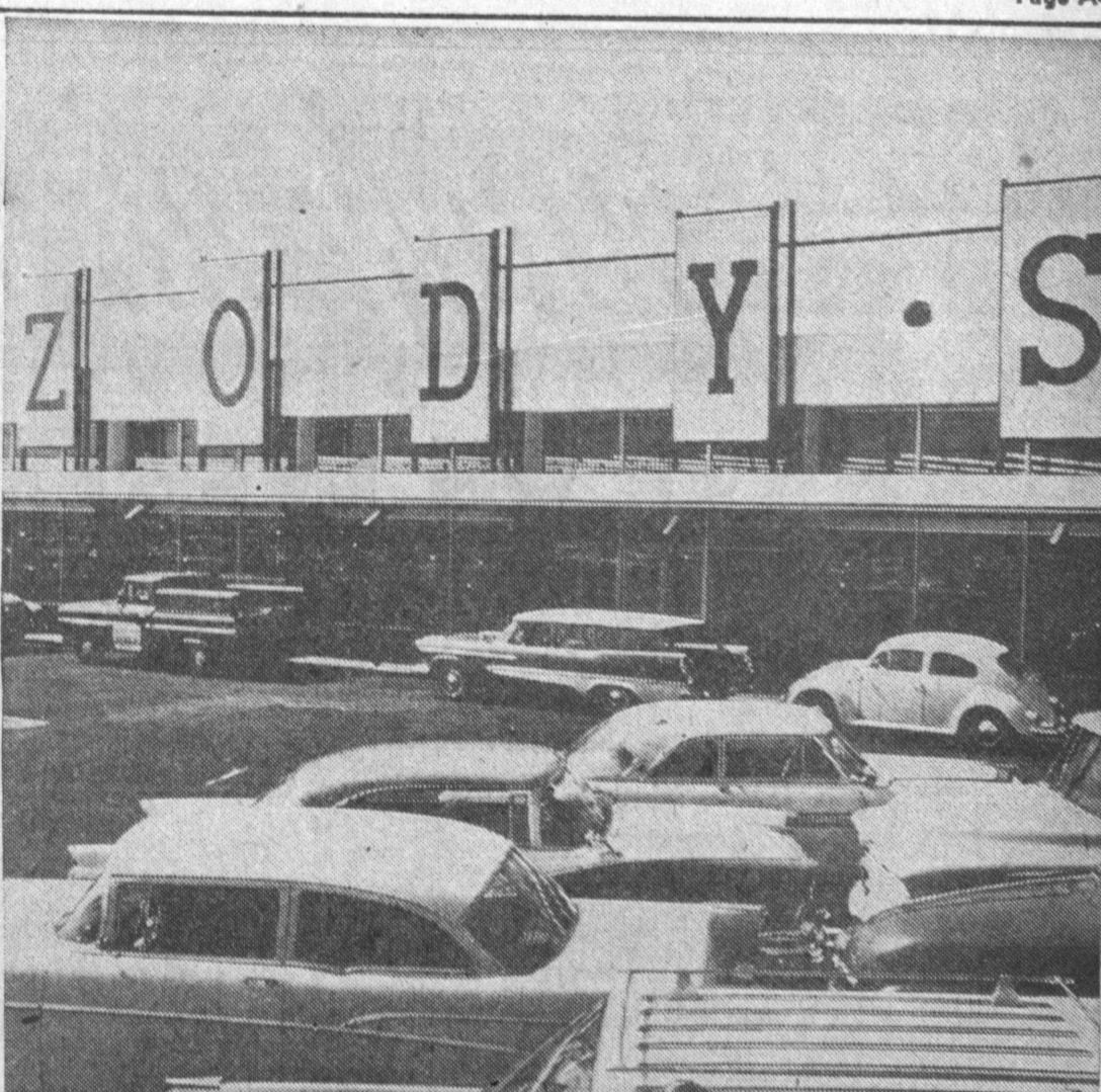
ABOUT TO OPEN its doors to thirty shoppers is this newest Zodys located in Long Beach. Thursday, August 10, is the grand opening date. Zodys officials, civic digni-

taries, and motion picture and television personalities will participate in the event. It is located at the Los Coyotes diagonal at Woodruff and Spring.