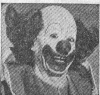
"BOZO THE CLOWN," comic star of KTLA's "Bozo," will make a personal appearance at the new Zodys Discount Department Store at Spring and Los Coyotes in Long Beach, Saturday, August 12, at 10:30 a.m. A free magic show, free gifts and special prizes will be presented to children in attendance.