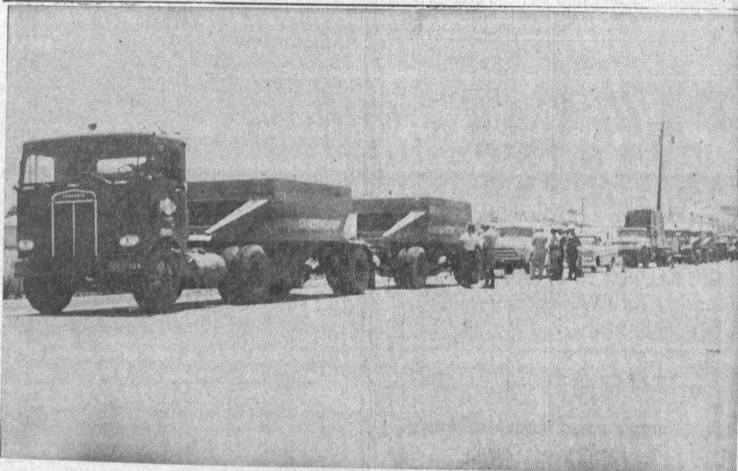
CHECKING STATION—Torrance police and Highway Patrol officers last week erected roadblocks and weighing scales on Hawthorne Blvd. and systematically checked each of the trucks carrying fill dirt along that route for freeway construction. Drivers were checked for licenses and permits; brakes

Classified 6-8D Darlene Cope 6A Sports 6A TV Log 7A TV Highlights 8A Women 1-3B