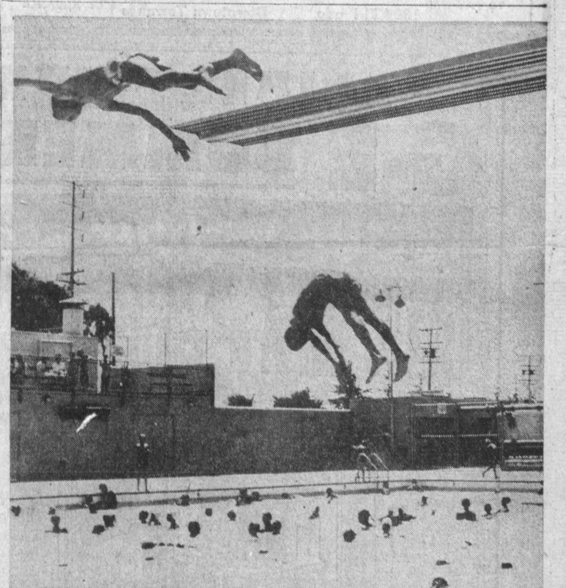
SUMMER SCENE—Thousands of youngsters headed for the beaches and pools when the blistering wave of summer weather hit the area last week. The placid waters of Bena-Plunge, shown above, was dotted with the heads of swimmers and lifeguards had to

To date, no interest has been shown in the tract by industrial developers. Proponents of the plan to rezone the area point out that plenty of industrial land remains in the city should any industry register its intention to move here.