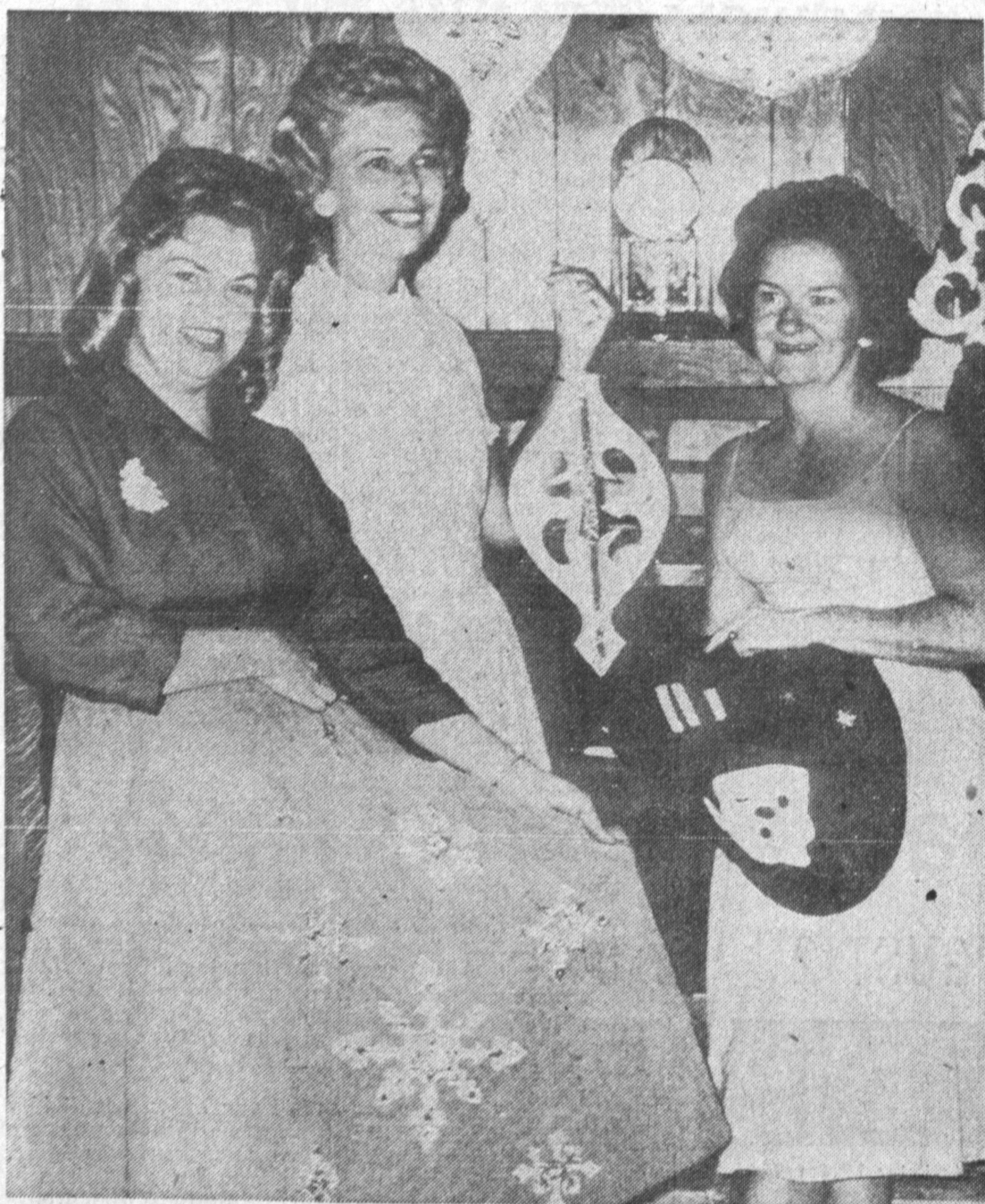
ANTICIPATING CHRISTMAS, women of Victor's Women's Club are busy making home decorations for the holiday season. Wall pieces, gay apparel, and various other items denoting the season will be sold at a bazaar