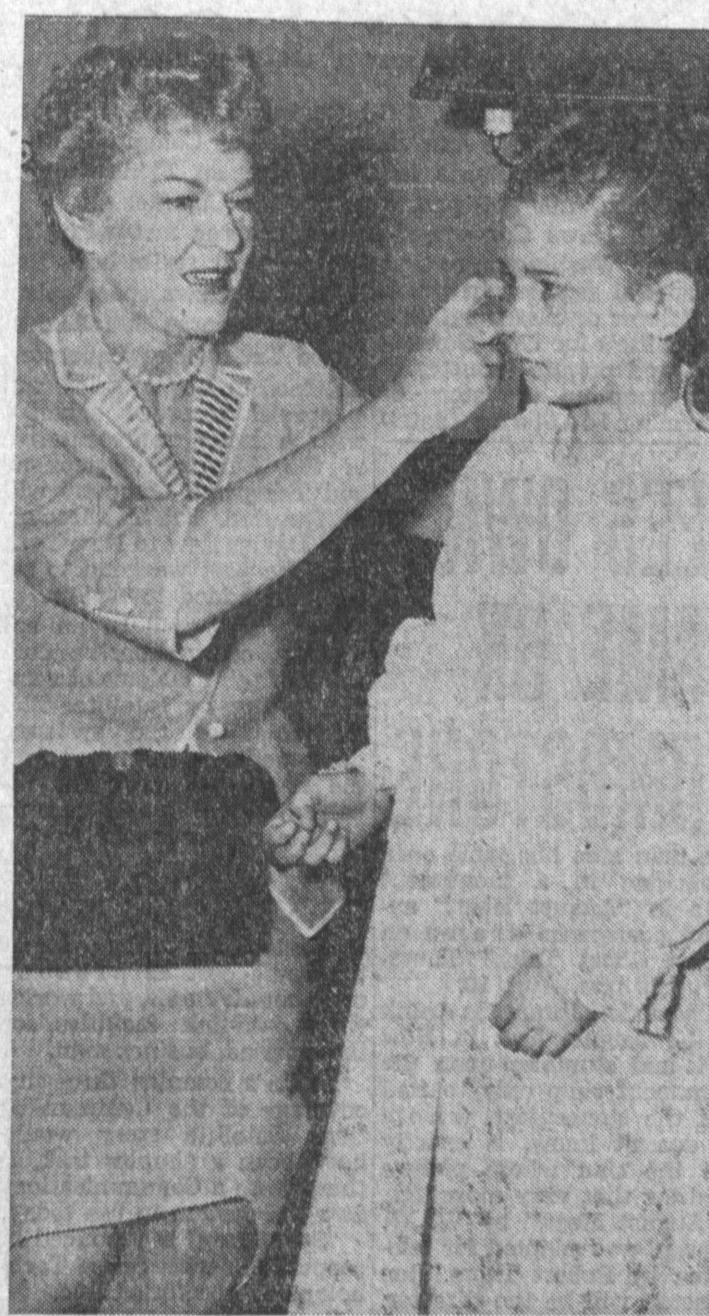
ADVENTURE THEATER—Claire Trevor stars as a teacher who becomes victim of a kidnap plot in "Fool Proof," seen Friday at 9:30 a.m. on CBS-TV, Channel 2.