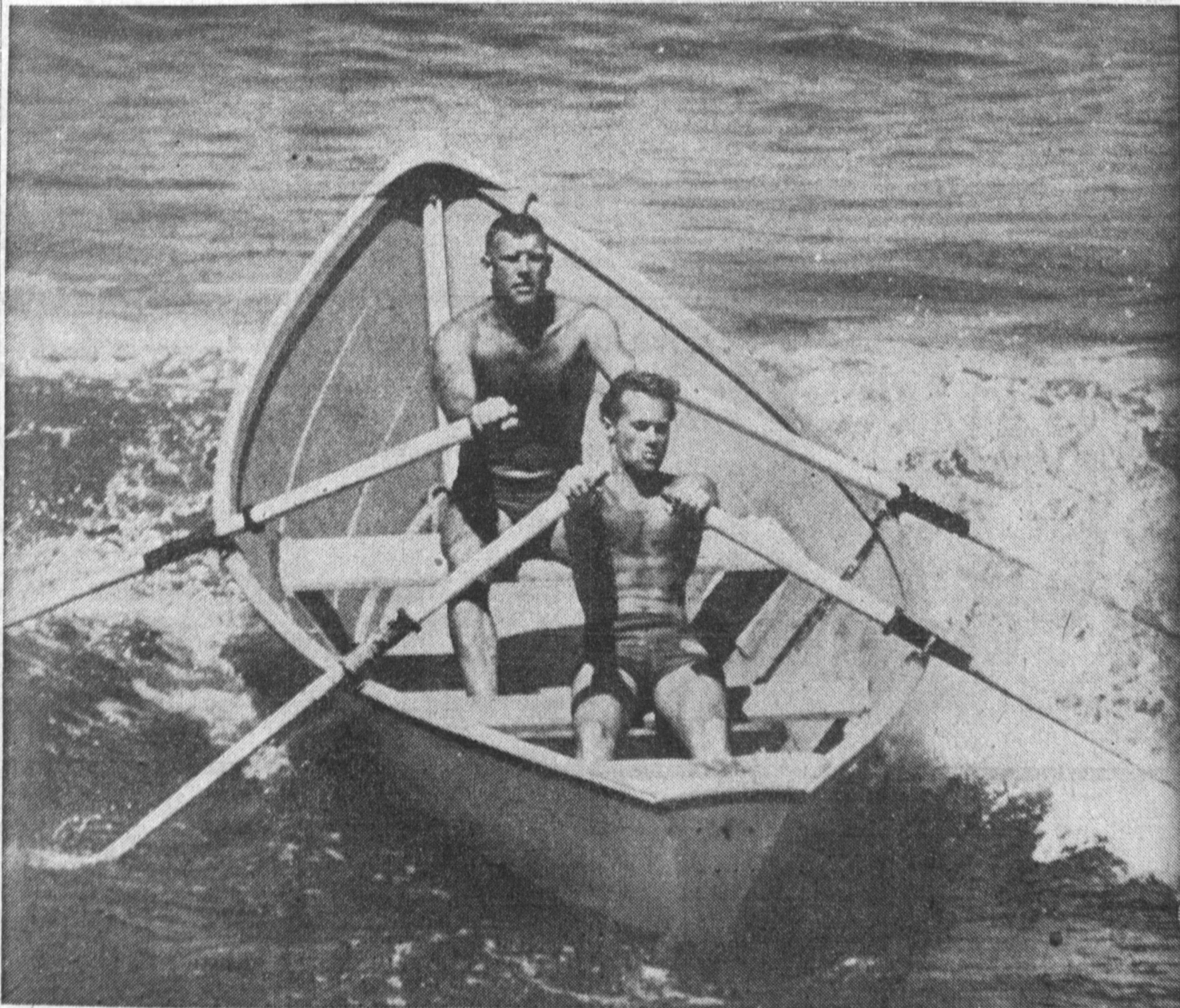
ROUGH WATERS won't discourage these Los Angeles County lifeguards when they compete for top honors in traditional Taplin Race at 1961 Hermosa Beach Holidays. In competi-