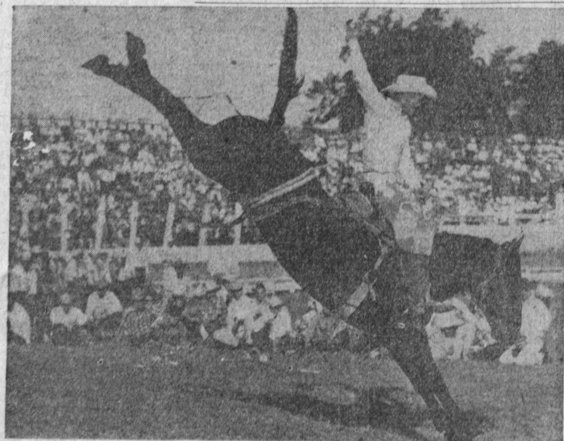
"OUT OF THE CHUTE"—Scenes such as this will be repeated many times over during the annual Mounted Police Rodeo scheduled August 5 and 6, 2 p.m. at the Torrance Civic Center, Saturday's opening session of the

It's so easy to place your Press Want Ad—just pick-up the phone and call DA 5-1515 anytime. We will be glad to help you word a result-getting low cost want ad. Turn your Don't Needs into ready cash. Call DA 5-1515 now.