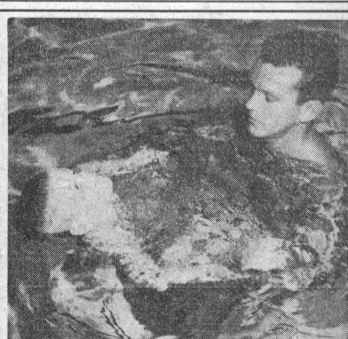
SURVIVAL—ACTION—SAFETY STROKE BEING TAUGHT TO A 4-YEAR-OLD STUDENT 3RD SESSION STARTS MONDAY, JULY 31ST

Eight home owners out of every ten report in a nationwide survey that they will do some remodeling of their homes in the next year. Among projects planned are wood deck patios, built-in bookcases, new wall paneling in popular softwoods, new carpet, enclosed carport, add a room, remodel basement and attic.