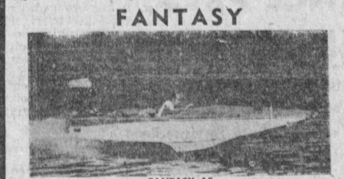
The fastest of the ski boats. Something new in design for speed and stability.

Again the leader in 1961 with America's most popular selection of fiberglass boats, famous for performance and ruggedness. Check the clean, classic lines of the Glasspar Seafair Sedan, that's functional beauty, this is America's most versatile and popular cabin cruiser, with helmman's seat, two full bunks forward for overnight anchoring, and rear seats. This dreamboat will do better than 30 MPH safely and is smooth riding in rough water with Glasspar's exclusive hull design. Just a quick dash of the hose and the famous Glasspar fiberglass hull is showroom fresh. Don't miss seeing all the models in the Glasspar line.